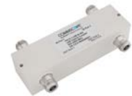
Hybrid Coupler (H-3-UW-N-AI6)