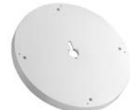
Absorber ground plane (7850475)