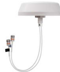
In-Building Omni (CMAX-OMF8-43-UWI53)