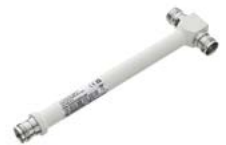
2-Way ValuDAS™ Splitter 4.3-10 Female Connector (VD-S2-CPUSEW-H-43B)