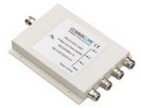
Four-Way Low Power Splitter N Female Connector (S-4-UW-NI53)