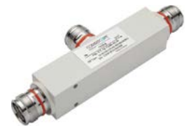
10 dB Tapper 4.3-10 Female Connector (CT-10-TUW-43-I6)