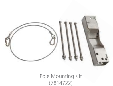
Pole Mounting Kit (7814722)