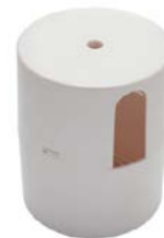
Omni Indoor Antenna Clamp (7705125)