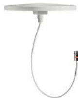
In-Building Omni (CMAX-OUS1-UW43-I53)