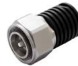
2 Watt 4.3-10 Male Connector (T-2-UW-43-M)