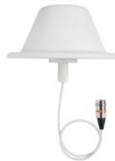
In-Building Omni (CELLMAX-O-43-WI)