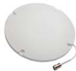
In-Building Omni (CMAX-OUS-43-I53)