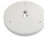
Absorber ground plane (7847185)