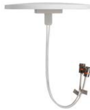
In-Building Omni (CMAX-OMF6-43-UWI53)