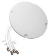
In-Building Omni (CMAX-OMF7-43-WI53)

*Please check next page for available absorbers