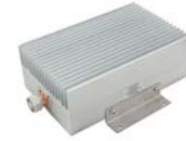
100 Watt 4.3-10 Male Connector (T-100-UW-43-M-I6)