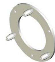
Cell-Max™ Omnidirectional Clamp (7543994)