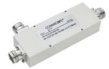
6 dB ValuDAS™ Coupler 4.3-10 Female Connector (VD-C6-CPUSEW-43B)