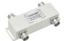
ValuDAS™ Hybrid Coupler 4.3-10 Female Connector (VD-H2x2-CPUSEW-H-43B)