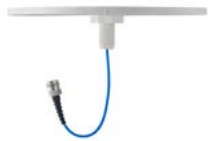
In-Building Omni (CMAX-OUS-TUW-43I)