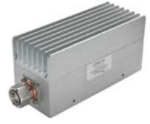
50 Watt 4.3-10 Male Connector (T-50-UW-43-M-I6)