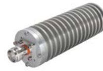
30 Watt 4.3-10 Female Connector (T-30-UW-43-M-I6)