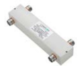
Hybrid Coupler (H-3-TCPUSEW-43-AI6)