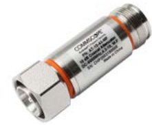
4.3-10 Male -4.3-10 Female Connector (AT-10-43-MF)