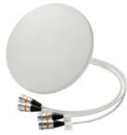
In-Building Omni (CMAX-OMF9-43-UWI53)