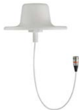
In-Building Omni (CMAX-O-43-UW-I53)