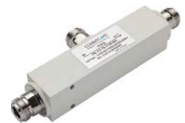
10 dB Tapper N Female Connector (CT-10-TUW-NI6)