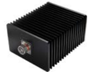
100 Watt 4.3-10 Male Connector (T-100-UW-43-M)